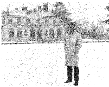
2 days later . . .