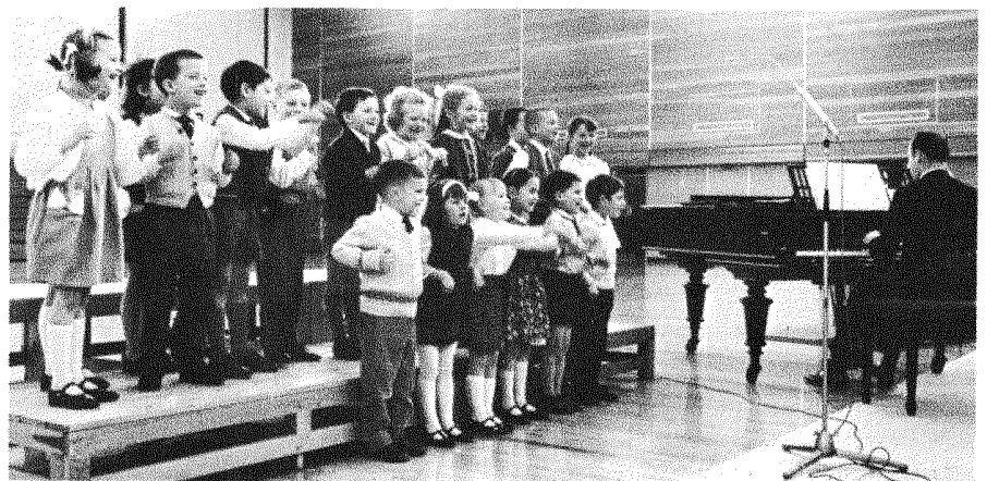
Tiny Tots treat us!